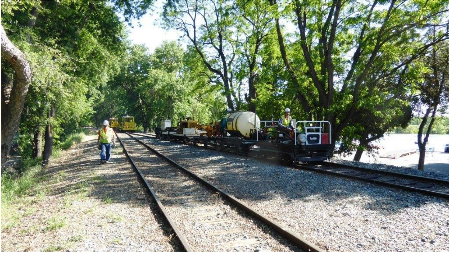
Weston on the motorcar leads the MOW Team back into town