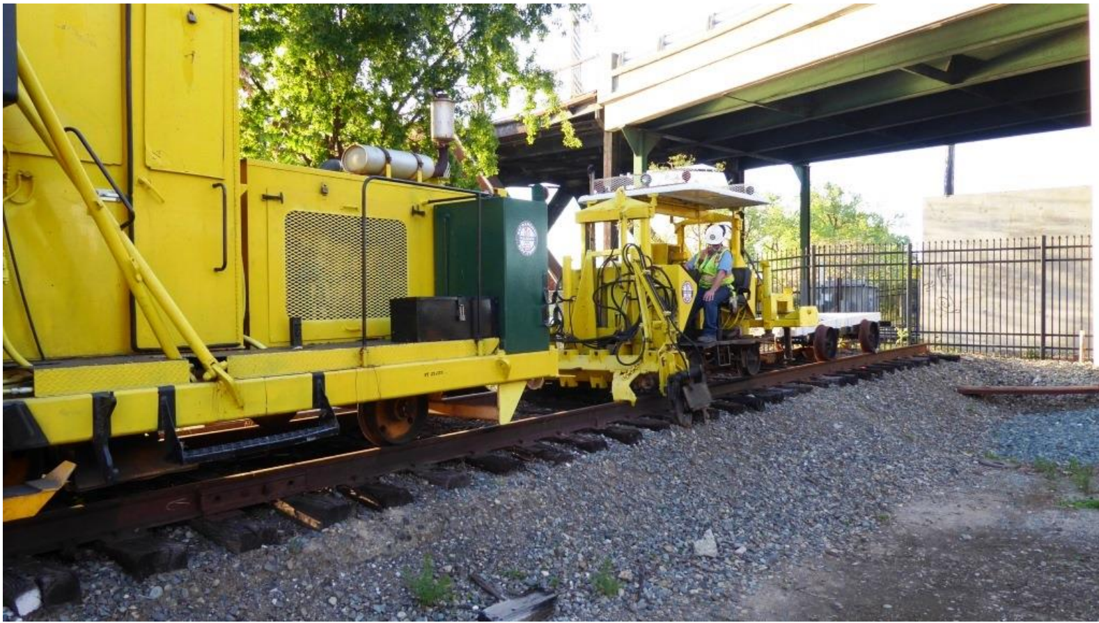
The Jackson 125 tie-exchanger was buried on the old 150 Track. Joe waits for the tamper to move so he can switch it into the lead position