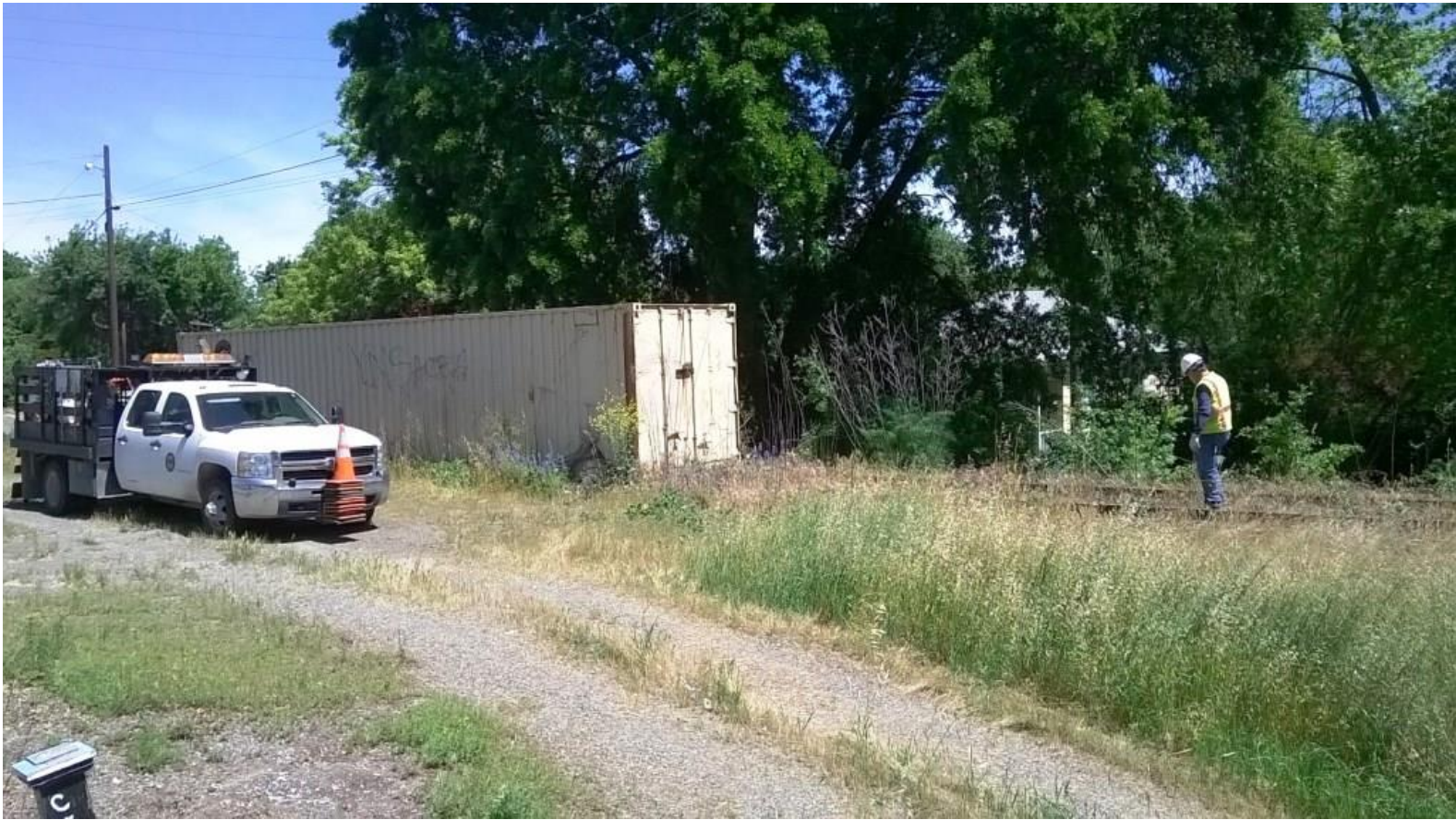
Cliff's Marina before...