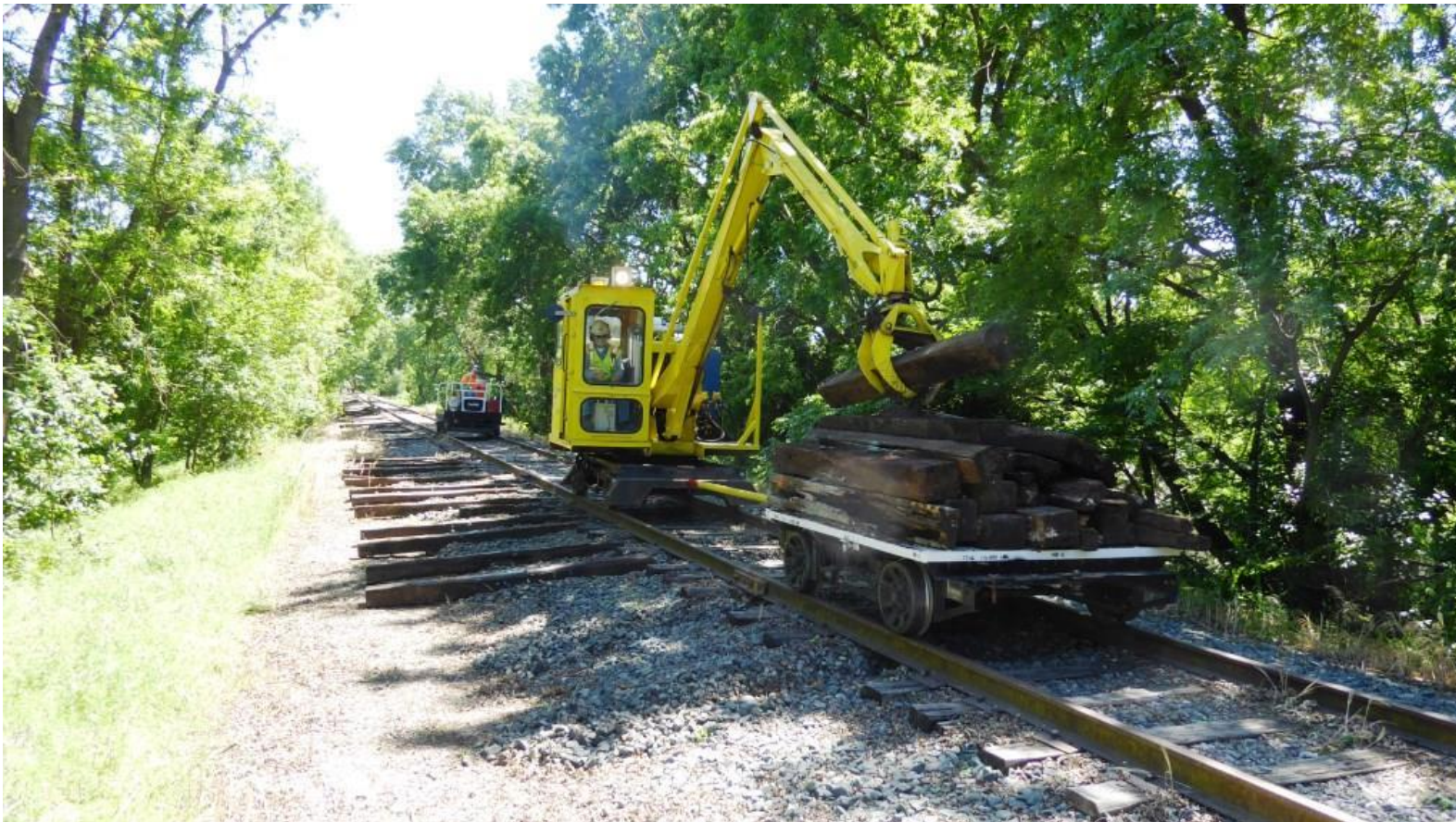
Cue the tie-crane!