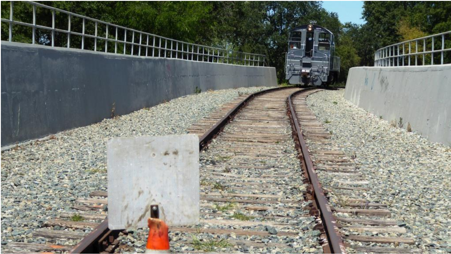
First train of the day stops well short of our red-flag on the I-5 Bridge