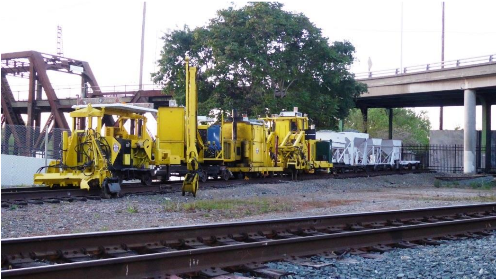
By evening's end, everything is lined up in the correct position