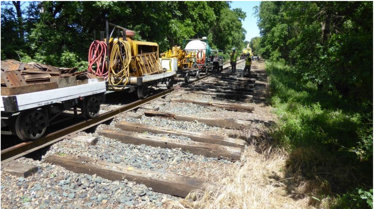
After just a couple hours, old ties are coming out exceedingly well and we're halfway down the hill