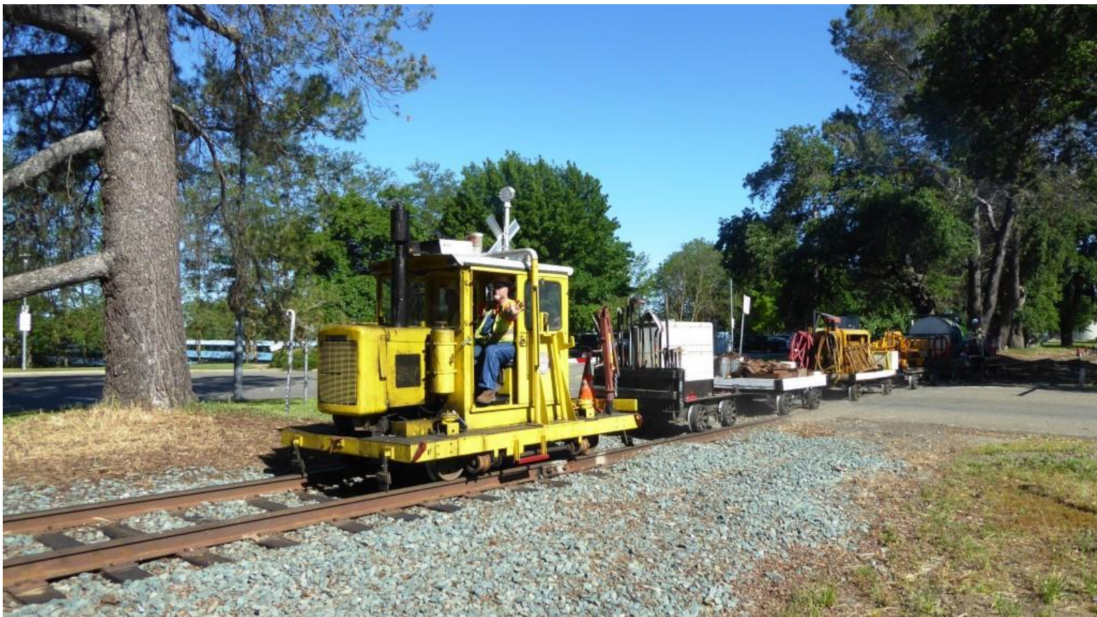
Saturday morning beacons and Mike F. in the Kalamazoo pulls the work-train past Front Street