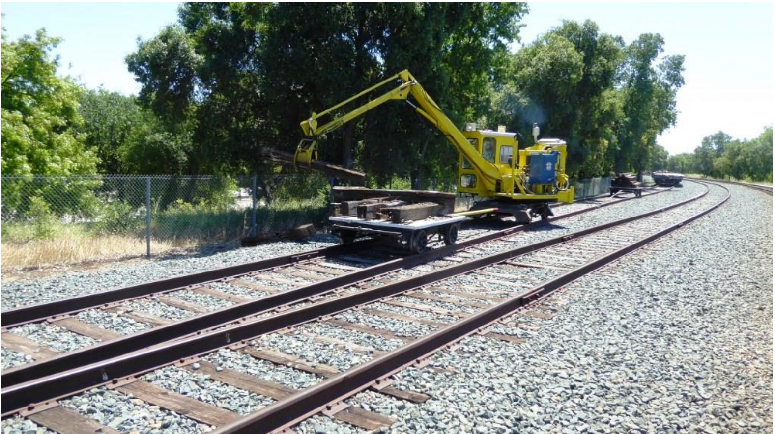
At lunch, Alan dropped a loaded flatcar on the Auxiliary Track at Baths then uses the crane to arrange ties on the second flatcar