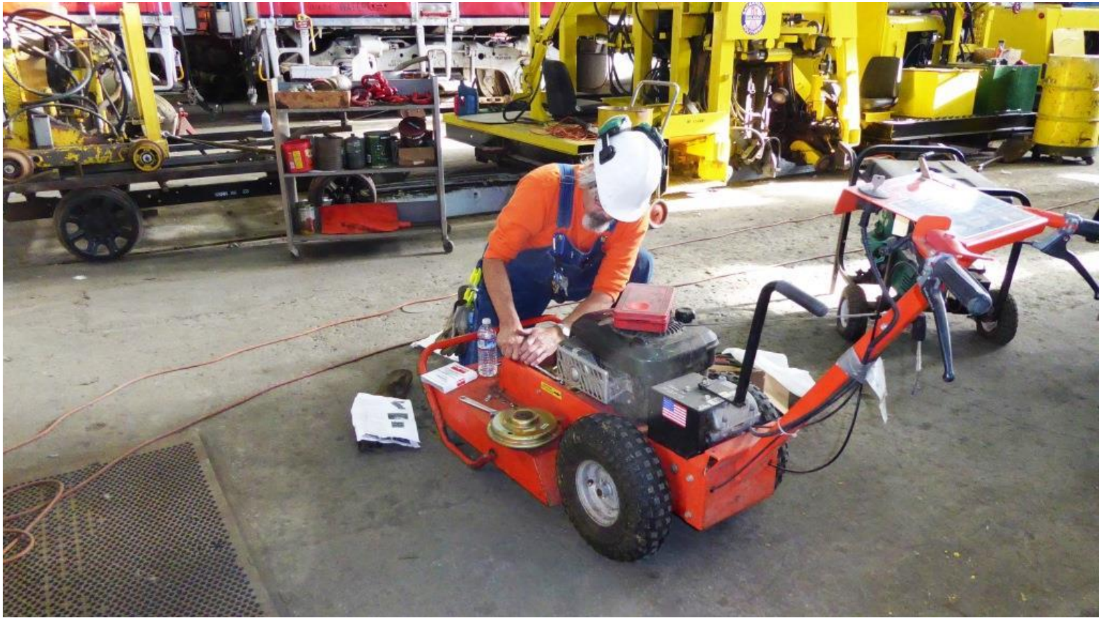
Ed works on one of the field-and-brush mowers