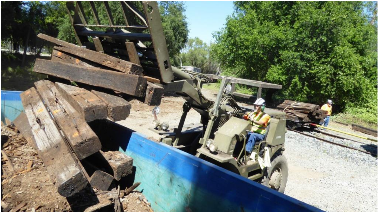
Ed on GM2 dumps another load of dead-ties into the dumpster