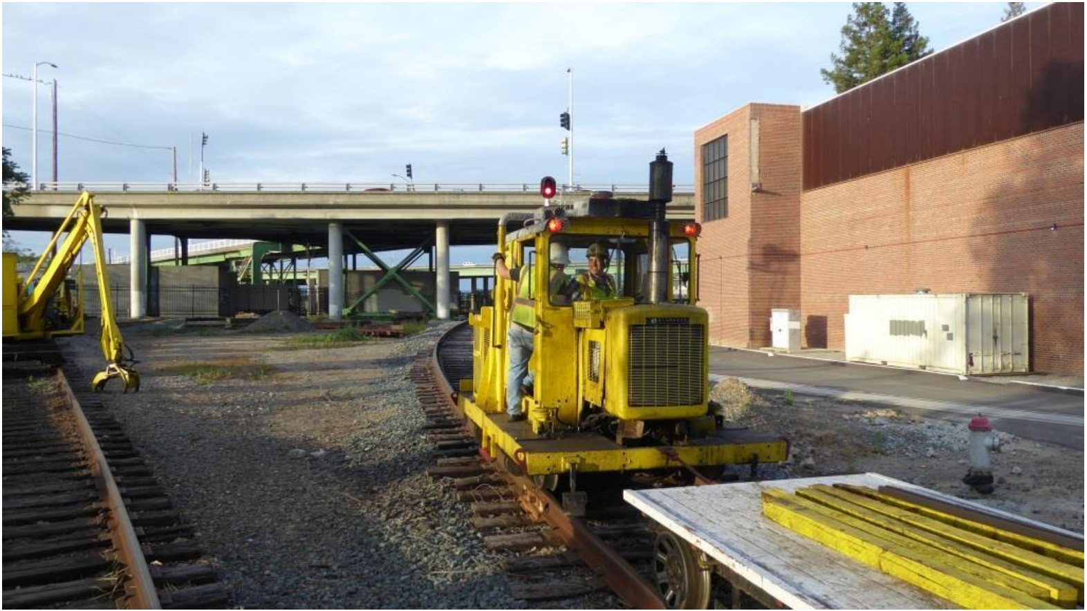
Mike H. and Weston wait for a green signal indication to move the flatcars over to the Shops