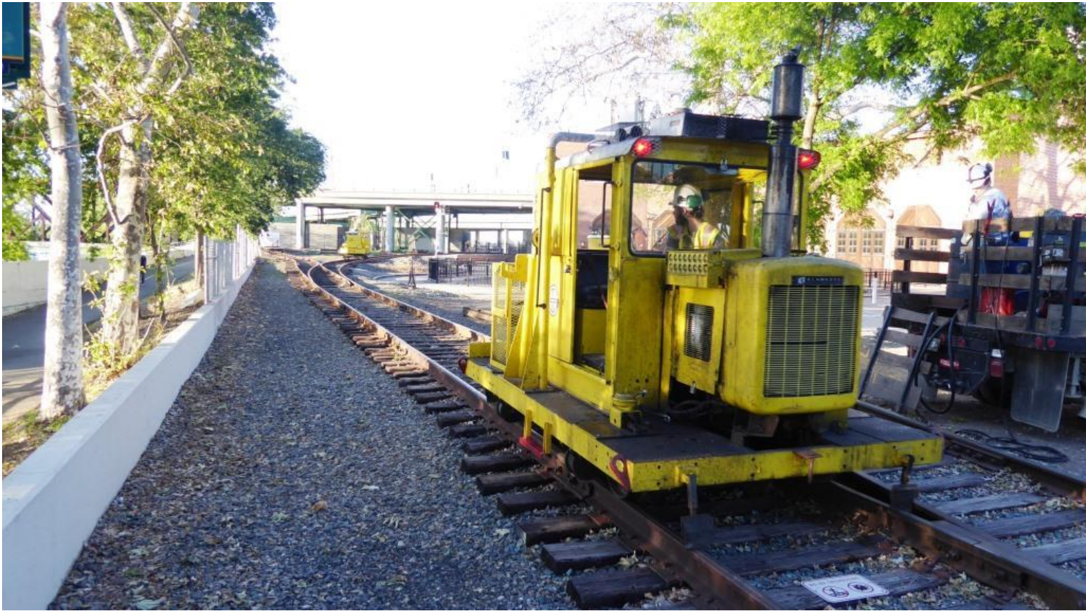
Matt M. at the helm of the Kalamazoo heads back up the hill to grab the hopper-cars