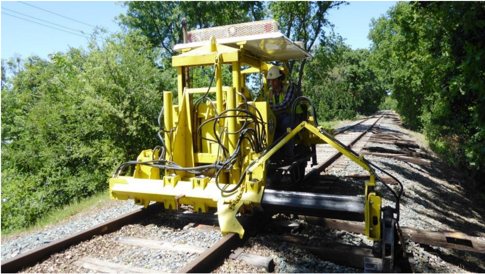
Weston on the 125 continues the push down the hill