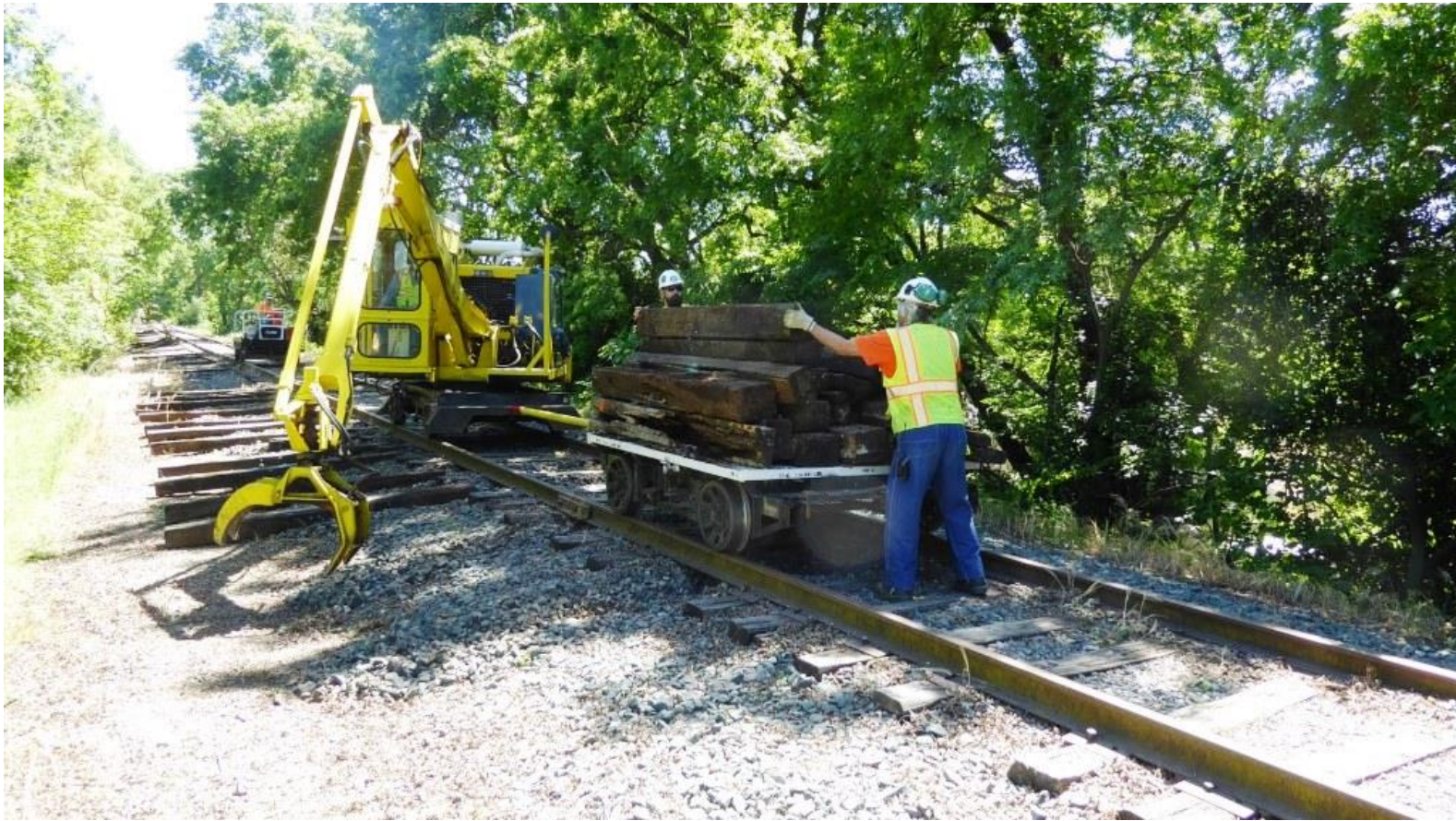
Matt B. and Ed balance the load on the flatcar