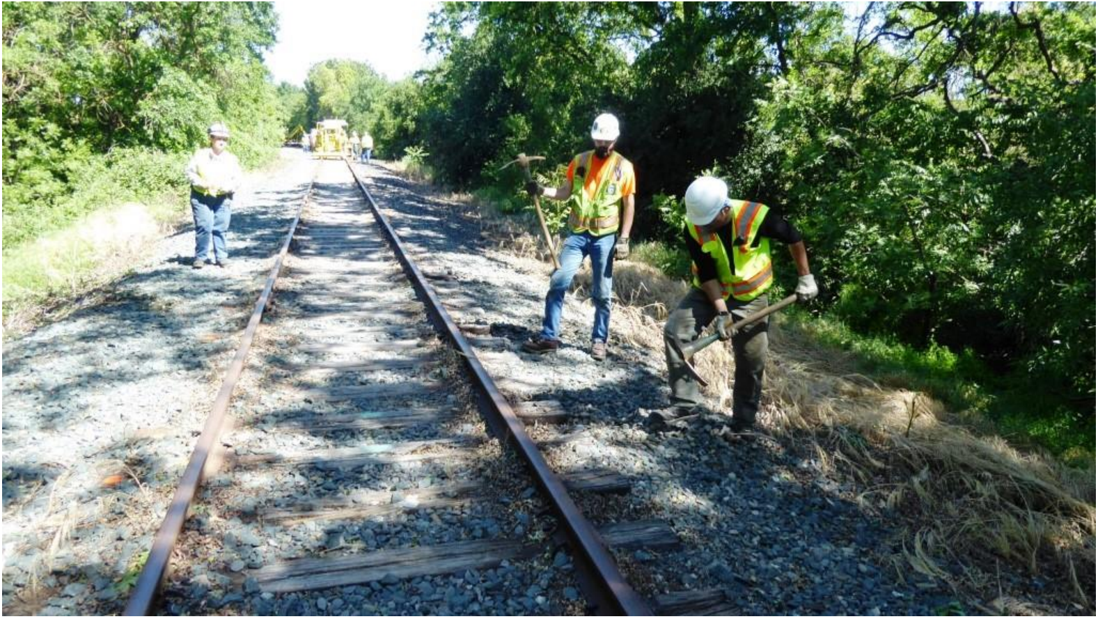
The brothers Blackburn working together to build a better railroad