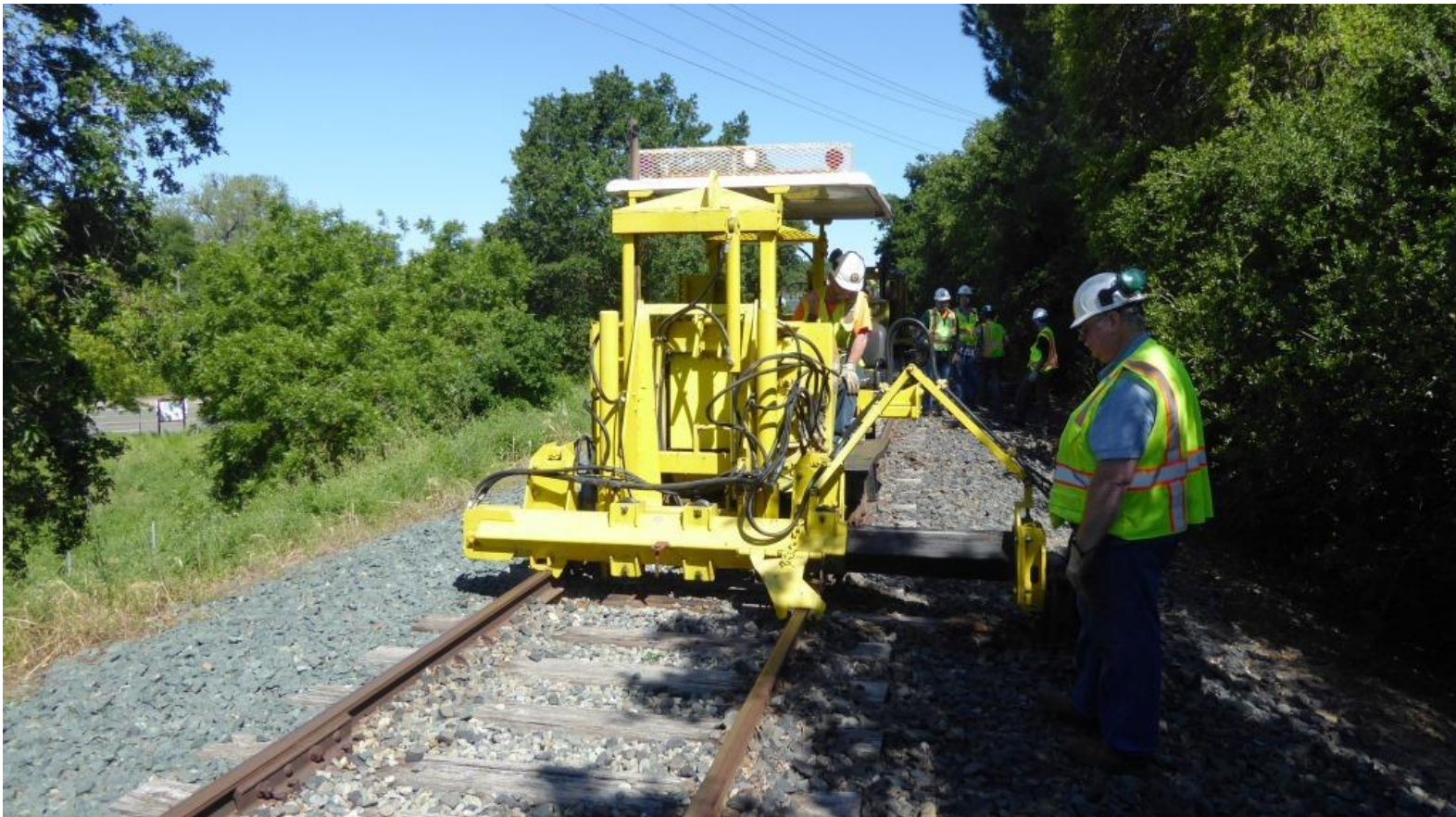
Despite the lift-cylinder being removed, Joe still manages to remove ties with the Jackson 125